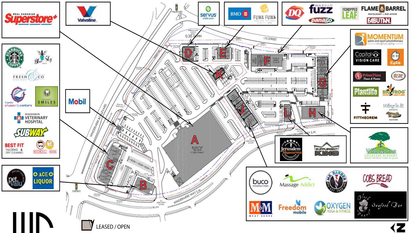
SITE PLAN - CONSTRUCTION COMPLETE